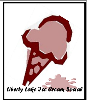
Liberty Lake Ice Cream Social